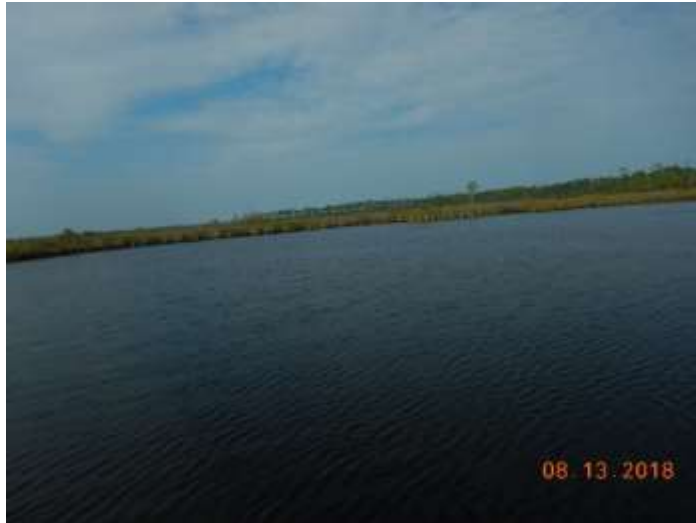
Photograph 3 – Tee Lake Directional Photo from Station