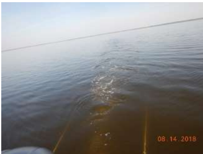
Photograph 23 – Upper Perdido Bay - Active Trawling