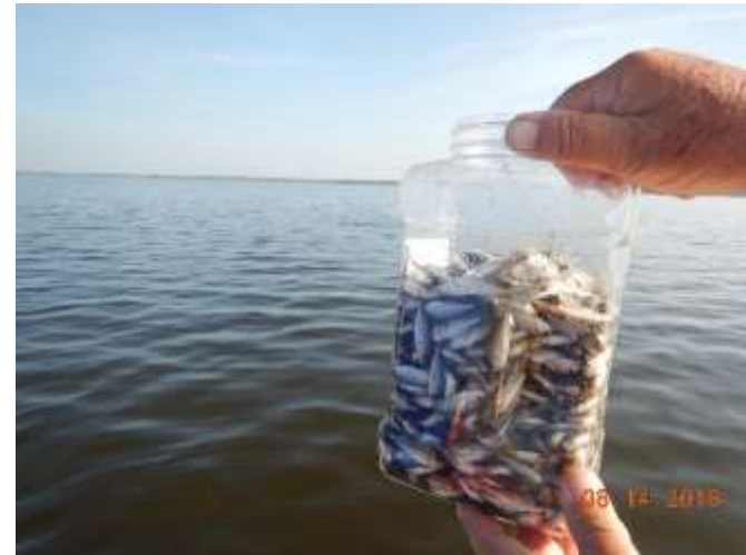
Photograph 26 – Upper Perdido Bay – Trawl #1 Going to the Lab