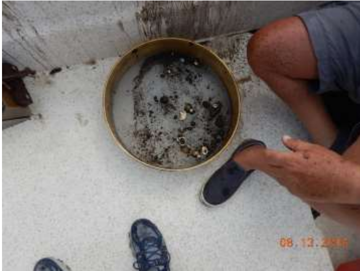
Photograph 5 – Sieved Ponar #1 from Tee Lake