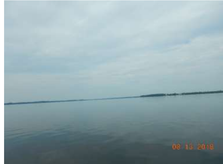
Photograph 18 – Station 29 On Station Photo