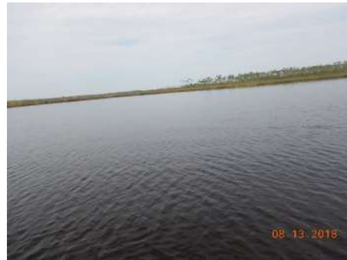
Photograph 12 – Wicker Lake Directional Photo from Station.