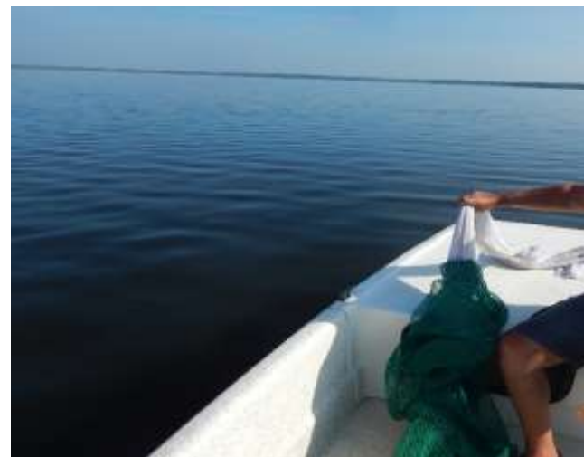
Photograph 24 – Upper Perdido Bay – Exposing Inner Net – Trawl #3