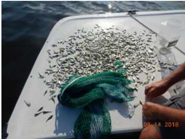
Photograph 25 – Upper Perdido Bay – Starting to Measure Trawl #1