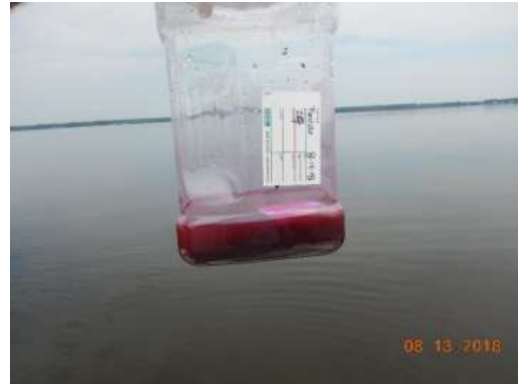
Photograph 14 – Station 29 Sieved and Preserved Sample