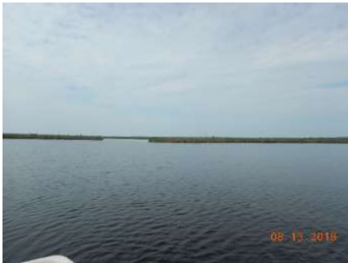
Photograph 11 – Wicker Lake Directional Photo from Station