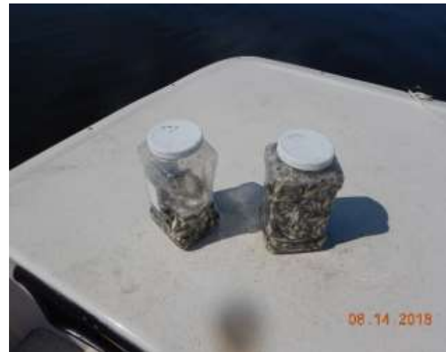
Photograph 16 – Upper Perdido Bay – Trawl #7 Formalin Preserved