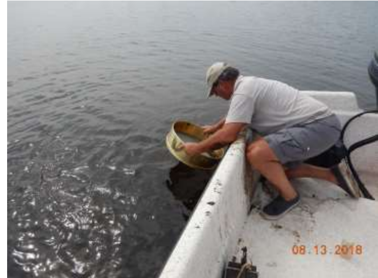
Photograph 6 – Sieving of Ponar #2 from Tee Lake