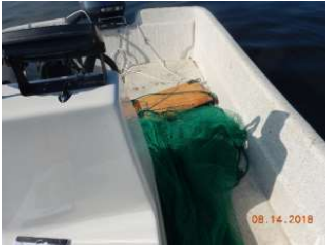
Photograph 21 – Upper Perdido Bay - Trawl Prep for First Trawl Tow