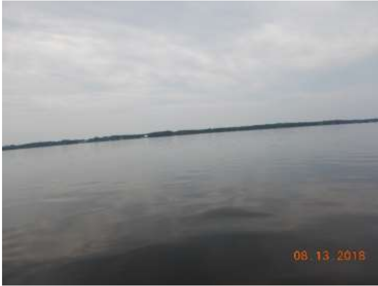
Photograph 17 – Station 29 – On Station Photo