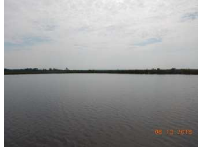
Photograph 10 – Wicker Lake Directional Photo from Station