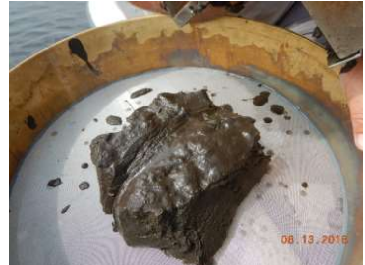
Photograph 8 – Wicker Lake Ponar Sample Prior to Sieving.