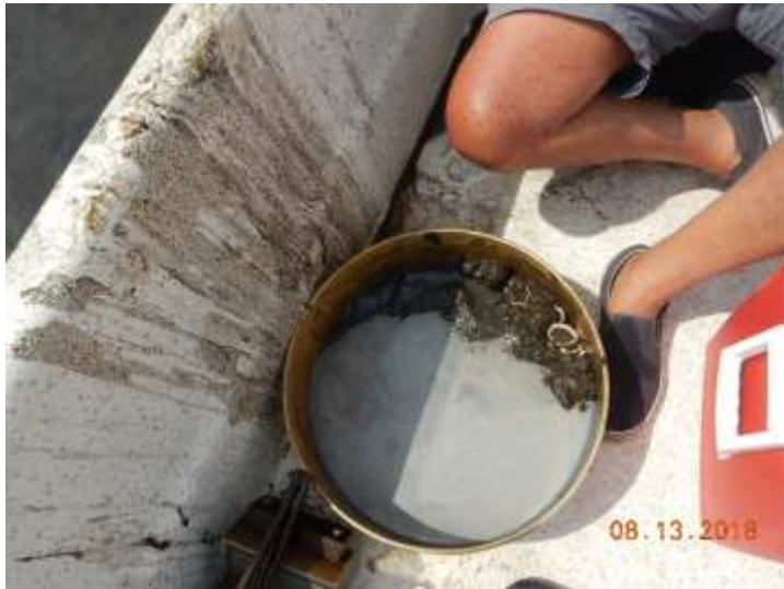
Photograph 13 – Station 29 Sample Sieving