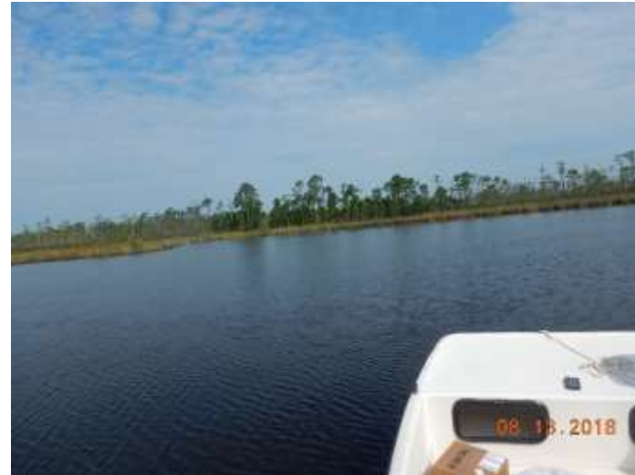
Photograph 4 – Tee Lake Directional Photo from Station