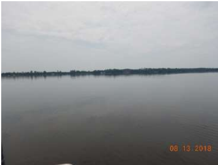
Photograph 19 – Station 26 – On Station Photo