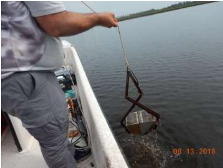
Photograph 7 – Wicker Lake - Ponar Sample Collected