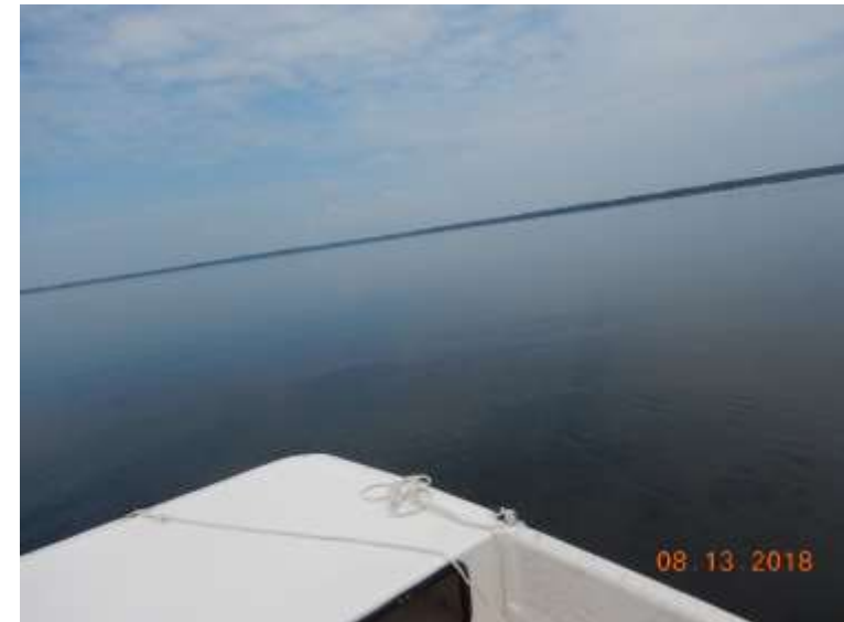
Photograph 20 – Station 26 – On Station Photo