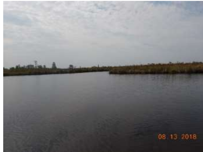
Photograph 2 – Tee Lake Directional Photo from Station