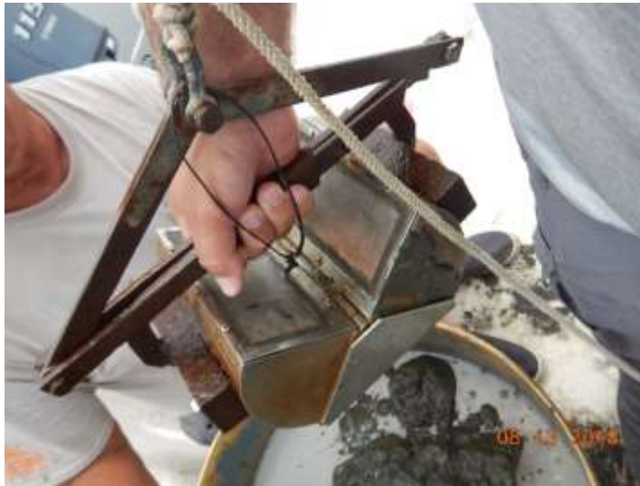
Photograph 15 – Station 26 Ponar Sample Collection and Removal