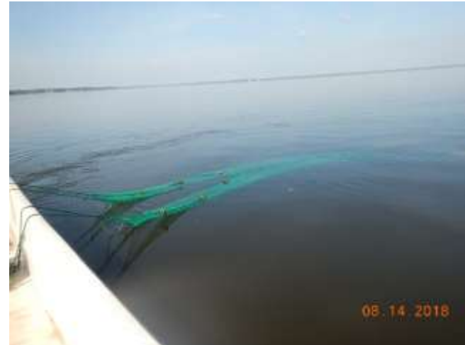
Photograph 22 – Upper Perdido Bay - Beginning of Trawl deployment