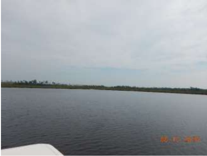
Photograph 9 – Wicker Lake Directional Photo from Station