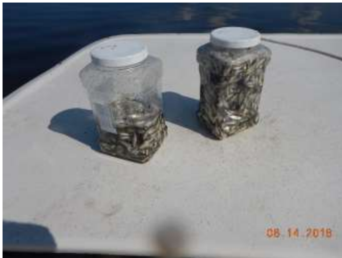
Photograph 15 – Upper Perdido Bay – Trawl #7 Collected for the Lab