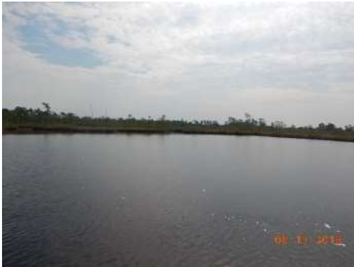
Photograph 1 – Tee Lake Directional Photo from Station