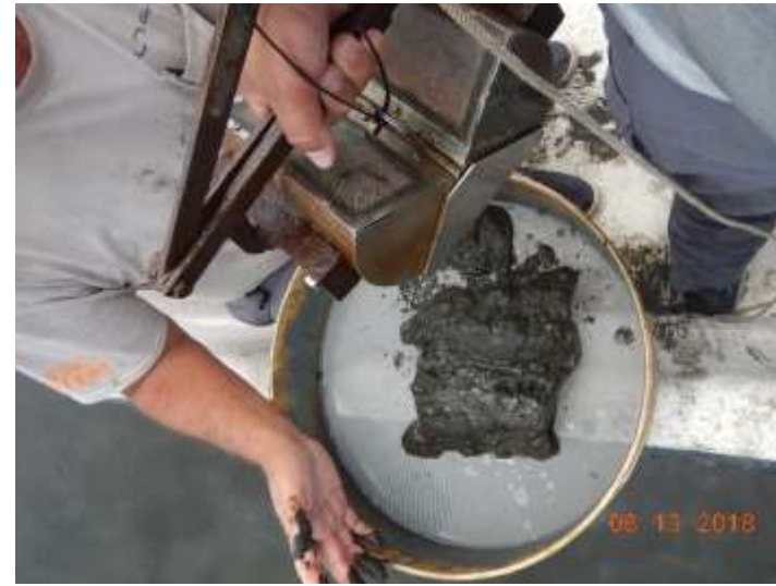
Photograph 16 – Station 26 Ponar Sample Collection and Removal